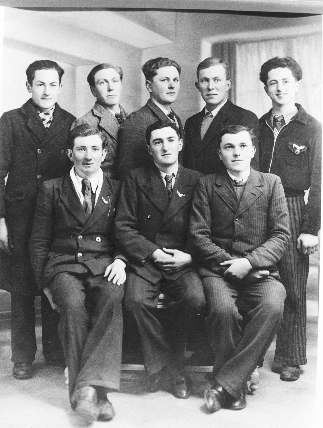
Tout-le-Monde - Classe 1944